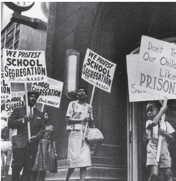
BIRMINGHAM—Citizens Protest School Segregation

Today is not only the first day of a new year, it's also a momentous anniversary for our nation. One hundred years ago, on New Year's Day of 1863, President Abraham Lincoln issued the Emancipation Proclamation, which called for an end to slavery in our country. Lincoln described his Proclamation as "an act of justice." I am writing this letter to make a case that as we enter this new year, more acts of justice are needed. The Emancipation Proclamation was only an initial step toward the achievement of true freedom for all. It has been 100 years, and black Americans continue to experience severely unequal treatment in all segments of their lives.